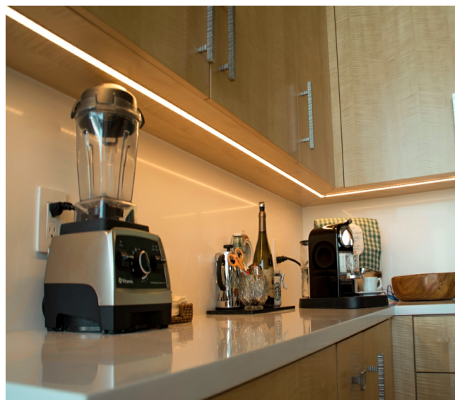
Under Cabinet Installation using Recessed Micro in Bright