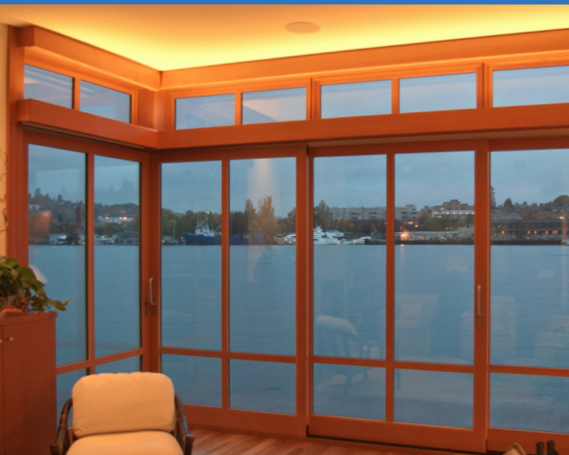
Cove Lighting in 2700K Color

Numerous housing, brightness, light color and lens options allow for the perfect solution for your under cabinet and accent lighting needs.