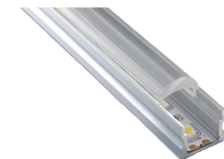
Single fixture with Focus Lens

Opal (o) - heavily frosted for maximum light diffusion (reduces light output).